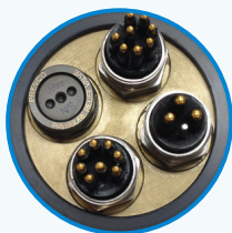
Connector Endcap Example Configuration

All pressure pods are pressure tested and provided with a Pressure Test Certificate.